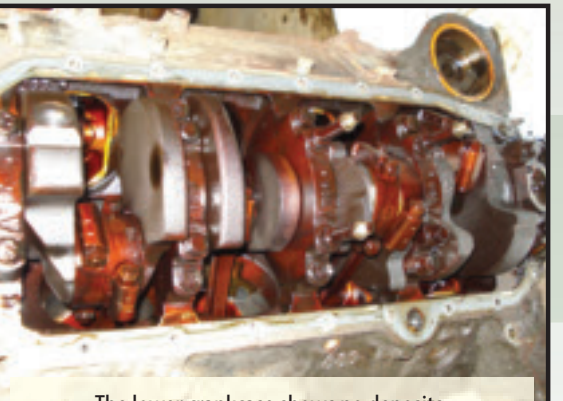
The lower crankcase shows no deposits.