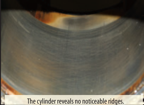
The cylinder reveals no noticeable ridges. Note crosshatch marks still are present.