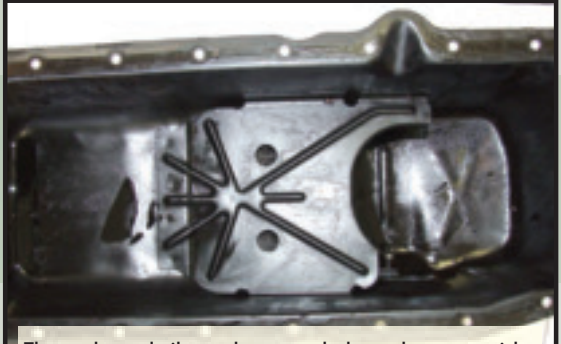
The uncleaned oil pan shows no sludge or heavy varnish.