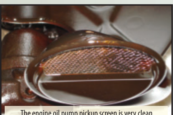
The engine oil pump pickup screen is very clean and has no deposits.