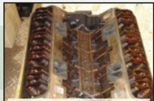
The engine valve train shown here is clean, with virtually no deposits in an area that typically has sludge and heavy carbon buildup with conventional motor oil.