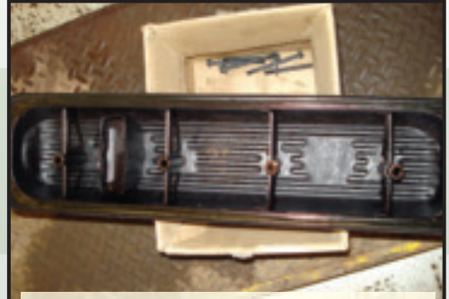
The inside of the valve cover is very clean with almost no deposits.